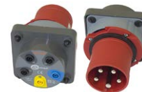
Three-phase socket adapter 63 A