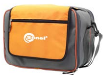
L4 carrying case