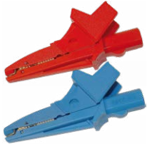
Crocodile clip 1 kV 20 A red / blue