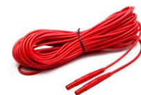
Test lead 5 / 10 / 20 m red 1 kV (banana plugs)