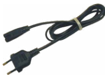
Mains power cable Euro 2-pin plug / IEC C7 plug